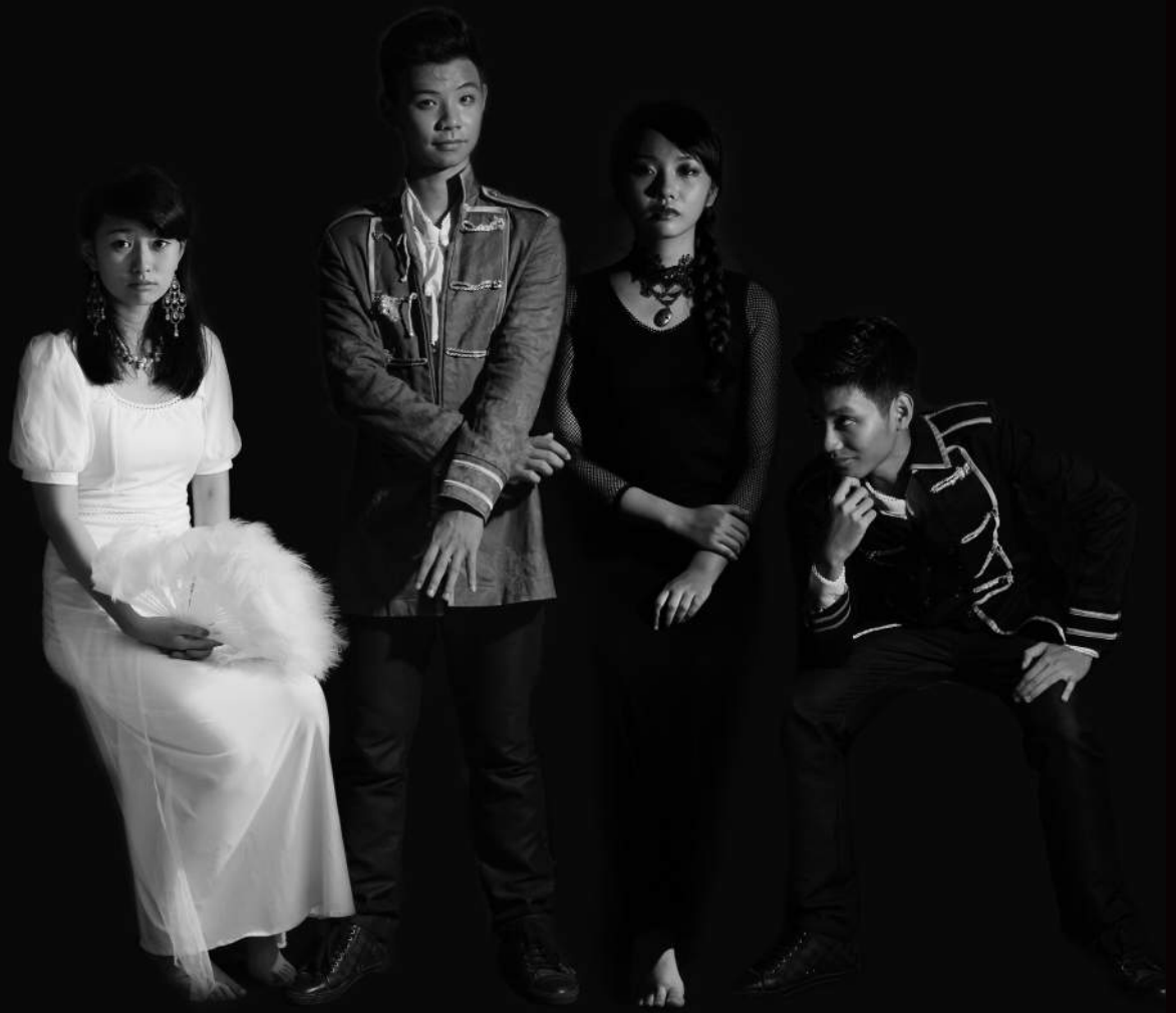
From left to right: Elizabeth, Victor, Emily and Barkis

Based on "Corpse Bride", the well-known movie by Tim Burton, "Emily" is set in an European country in the Renaissance. The musical revolved around the love triangle between Victor – the prestigious son of a bourgeois family, Elizabeth – the lovely daughter of a noble clan and Emily – a corpse from Hell as well as the greedy and villainous schemes of Barkis, the antagonist.