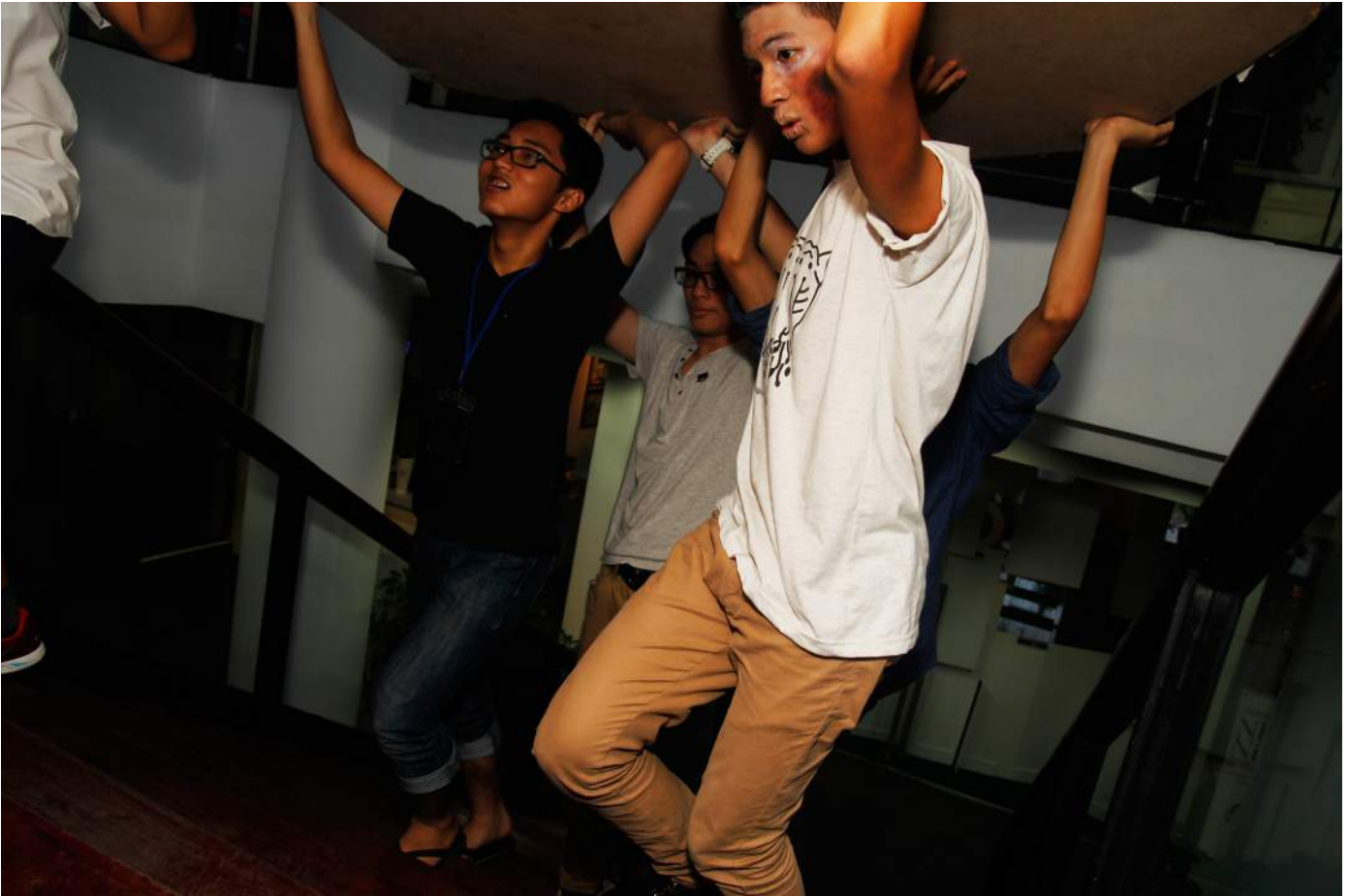
The signature prop, "The Ball Mask", was handmade and contained of 100 paper boxes to create a 4m x 2m x 0.8m 3D model of a mask.