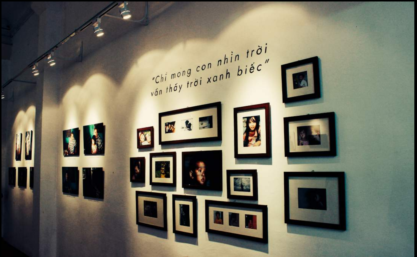
"Hope for the future" Section