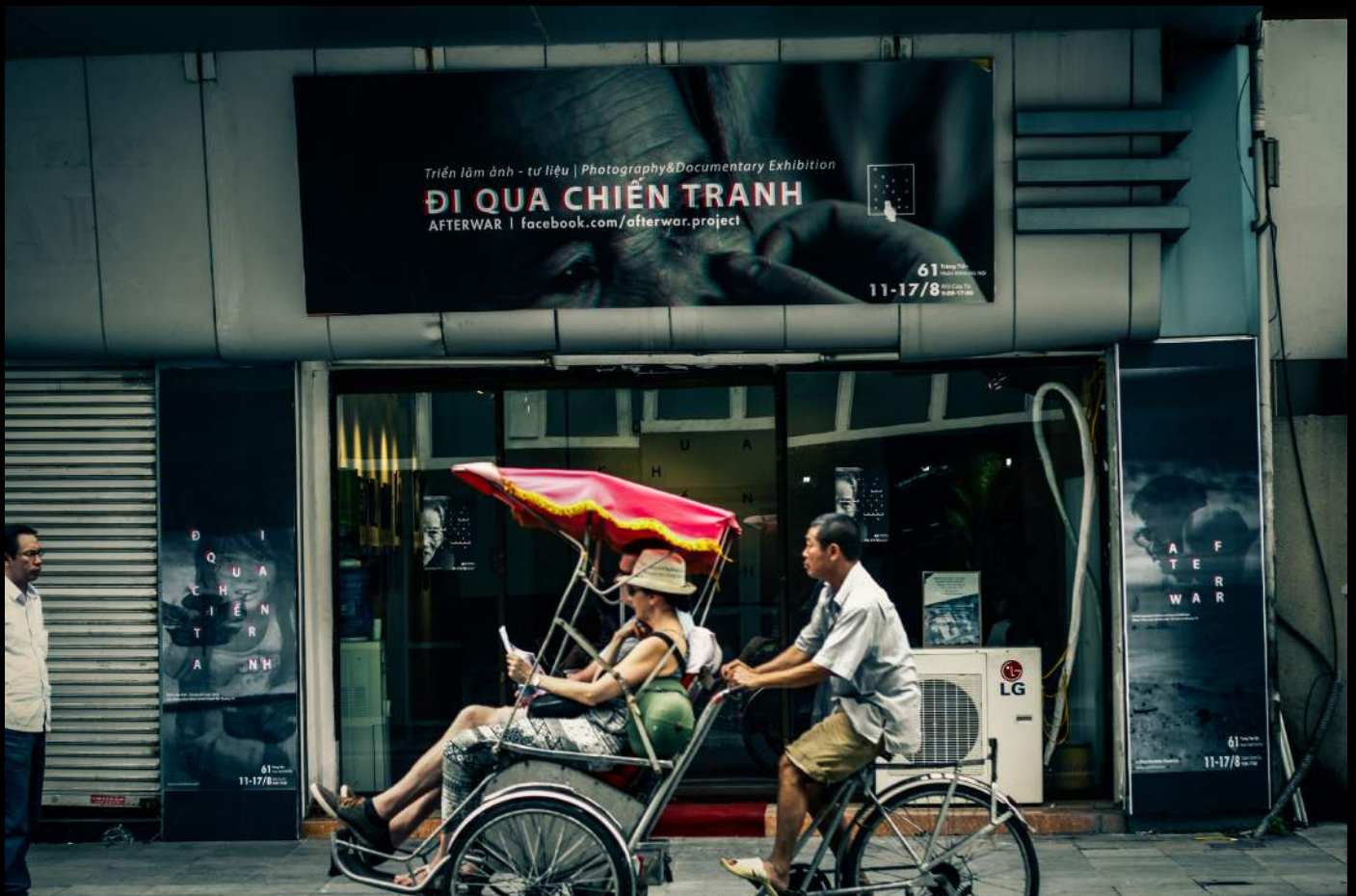
My outlook design of the exhibition.

The exhibition was divided into two parts: "The Harsh Reality" & "Hope for the Future", featuring 50 photographs, 10 stories and a short documentary film about people who were born and raised in peacetime but suffer from physical and mental consequences of the two wars. During the opening week, the exhibition attracted over 1000 visitors of all ages and nationalities. Our team successfully raised the fund of approximately USD 2000 for Quang Tri war victims.