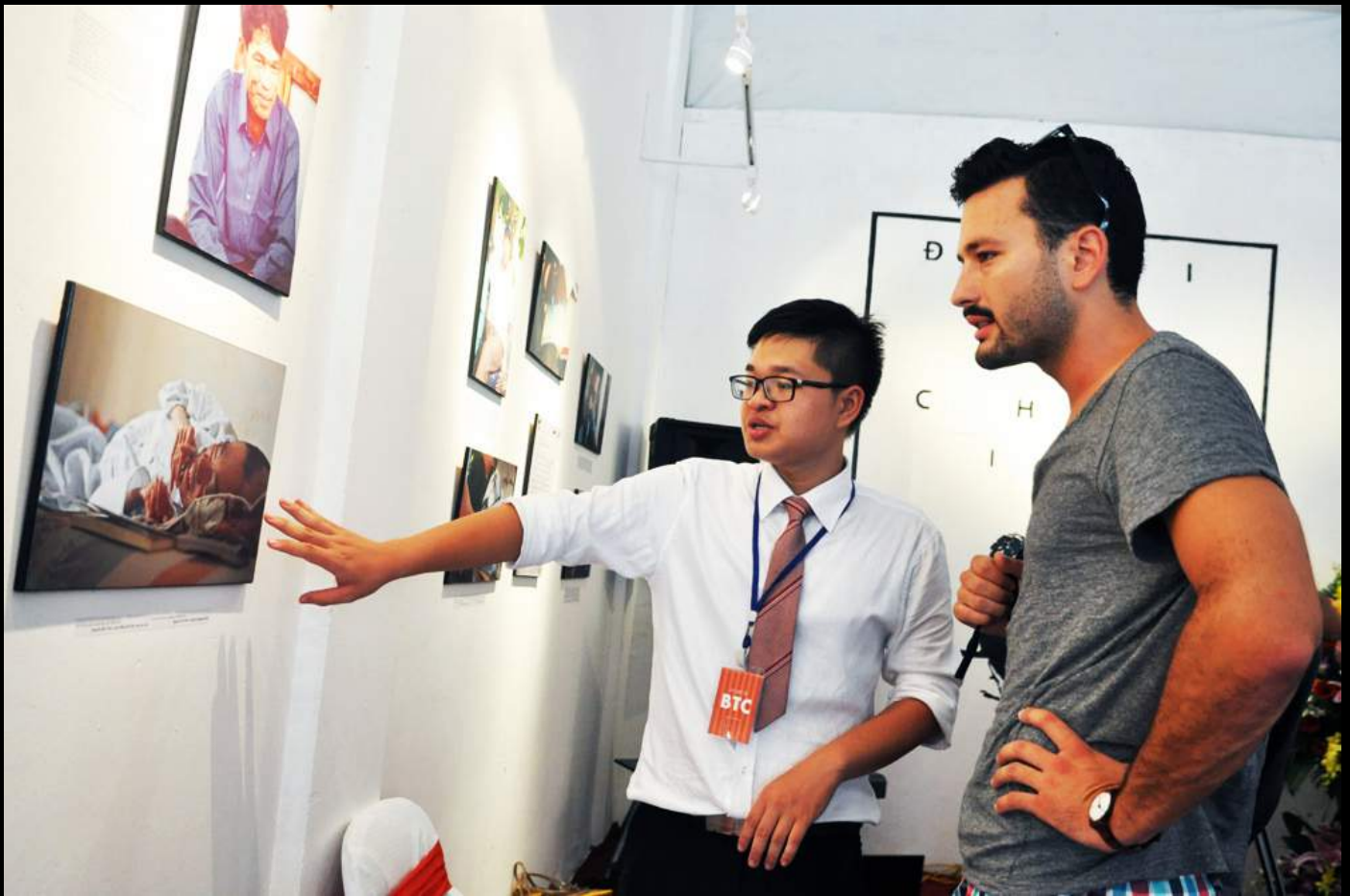
During the exhibition, I was also a tour guide for the visitors