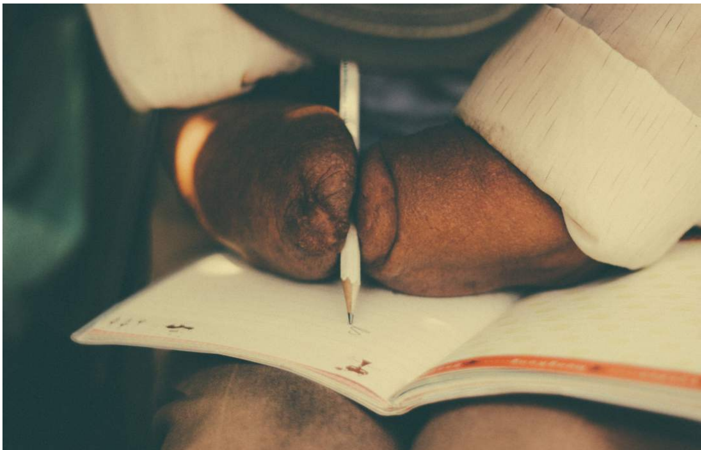
A landmines victim wrote us his self-made poem as a present