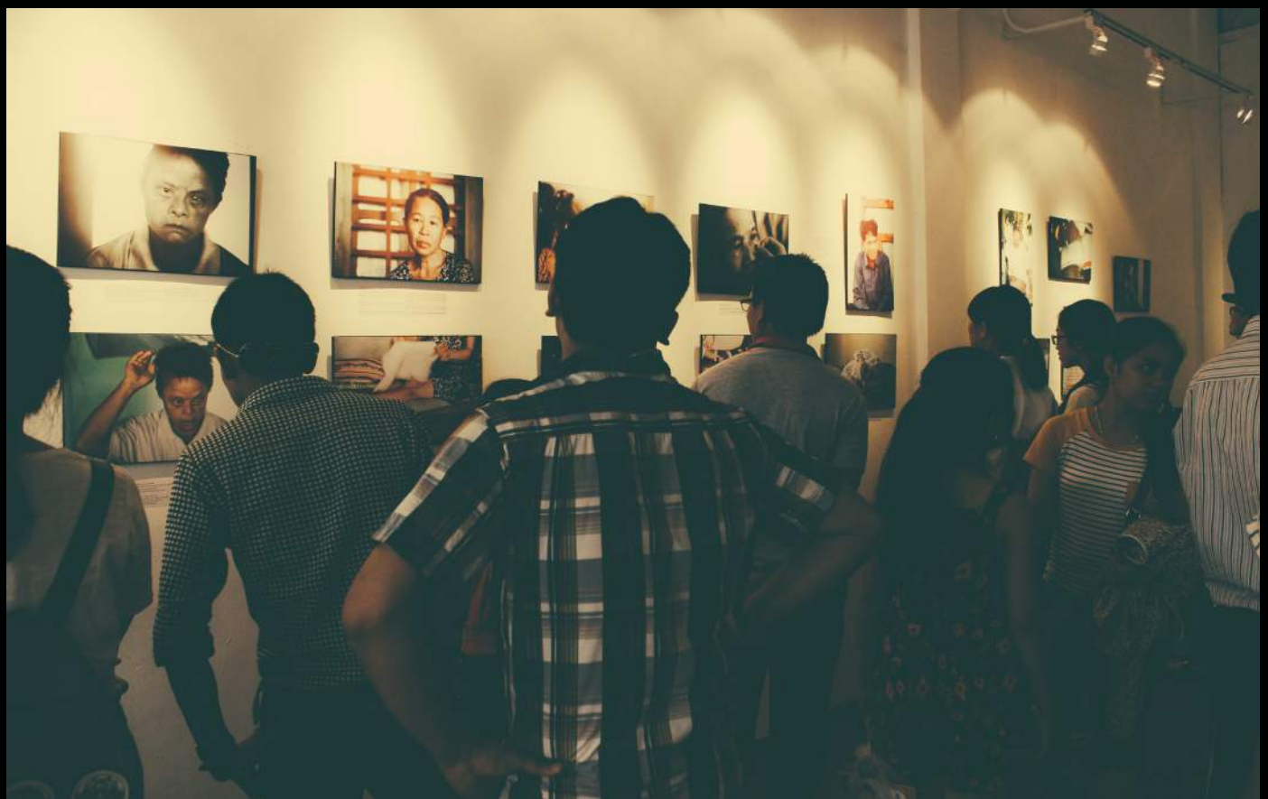
"Harsh Reality" Section