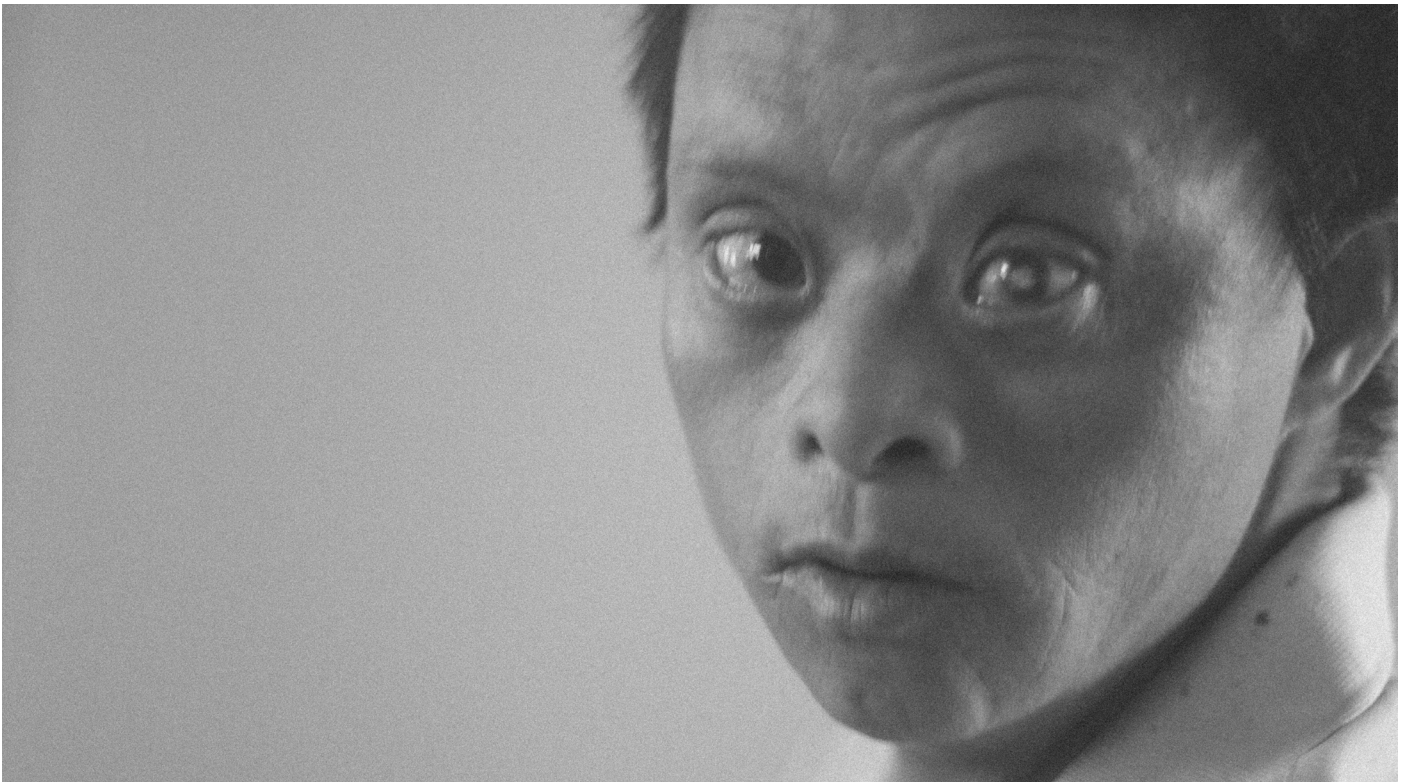
The look of an Agent Orange Victim

As a member of the media team, I took charge of capturing videos during our interviews with the landmines and Agent Orange victims. Under the heat of 40 degree (Celsius), there were times when I thought that my camera was so heated that it could not function. However, from the trip, I was able to capture vivid moments and have a truer perspective on the subjects of our project.