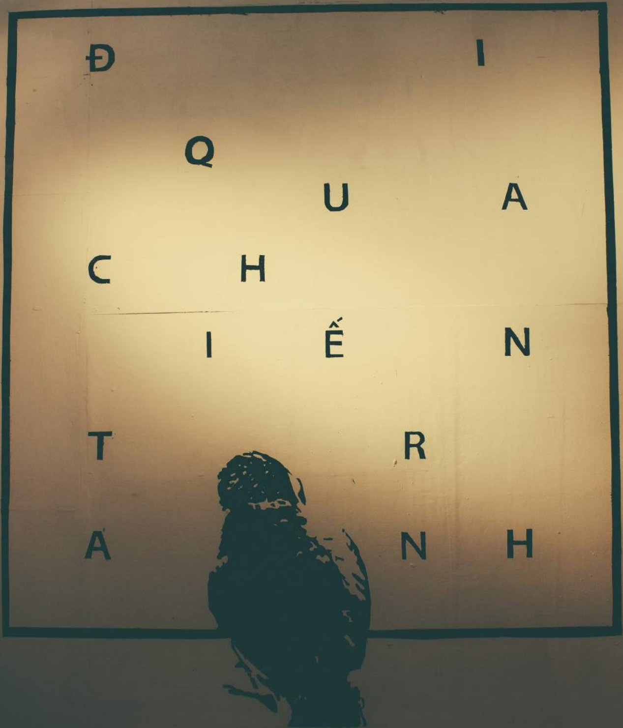
My painting of the logo on the signature wall of the exhibition. The word in the logo, "Di Qua Chien Tranh", stands for "After War"