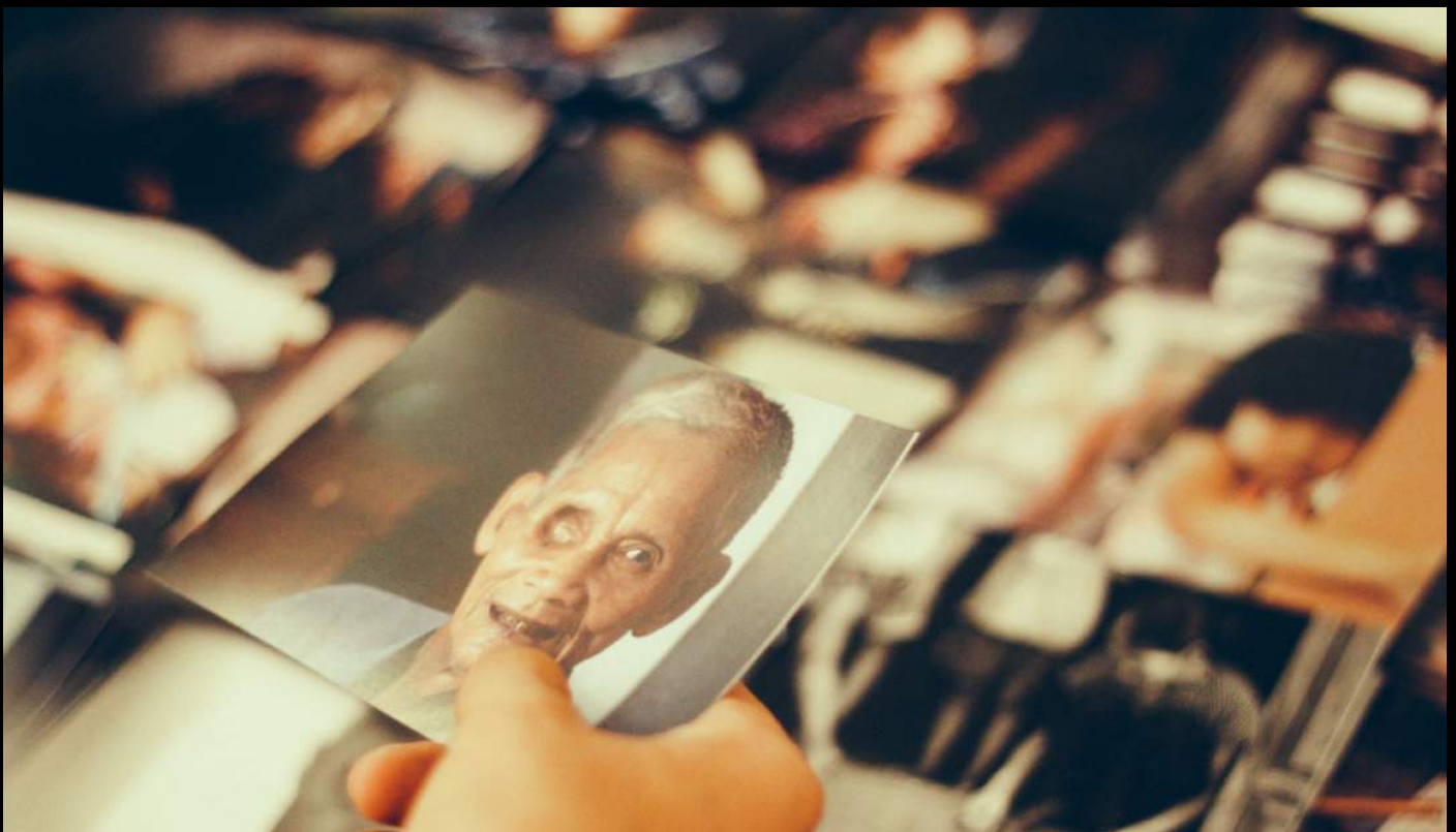
Over 30 newspapers and e-news have posted articles about "Afterwar Documentary & Photography Exhibition". We were also interviewed by national television channels such as VTV1, VTV6 as well as other digital channels