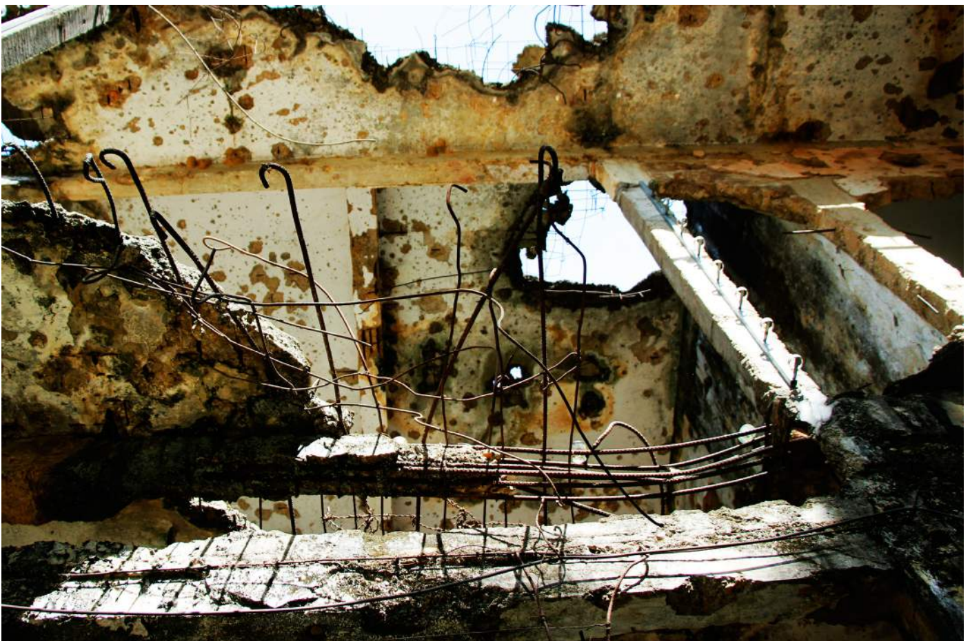
Bo De School